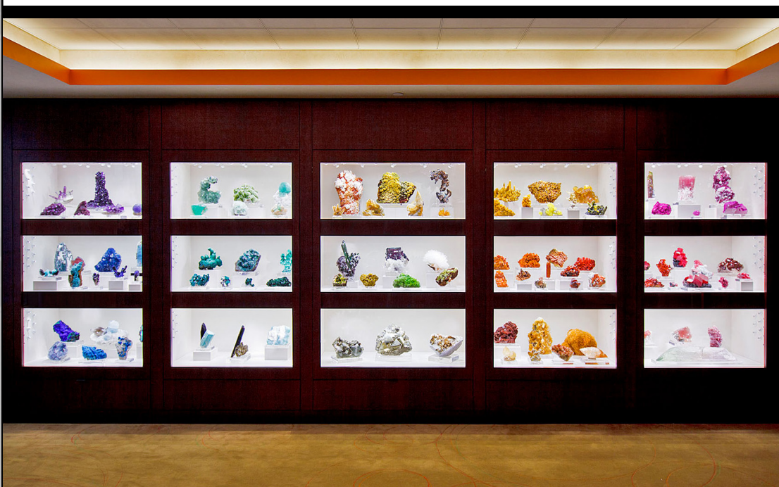
Private Office, Texas