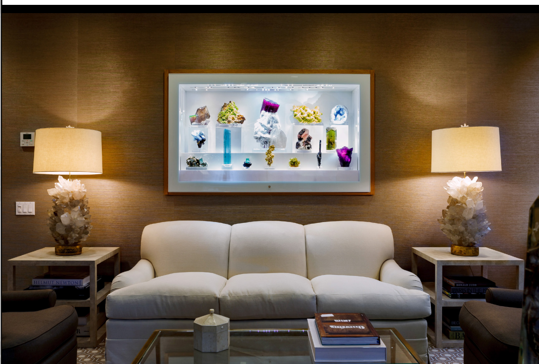
Private Office, New York